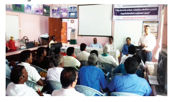
benefit of NABARD Club Members and farmers of Karur district. A total of 30 farmers were benefitted.