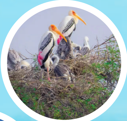
Vedanthangal Bird Sanctuary